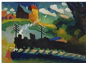
Murnau, Castle and Train- Wassily Kandinsky

We will be developing our art skills to create our own transport picture in the same style as Kandinsky.